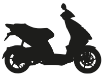
MATT BLACK METEORA