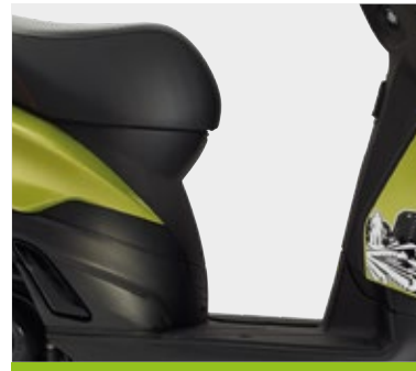
COMPACT DIMENSIONS AND FLAT FOOTBOARD