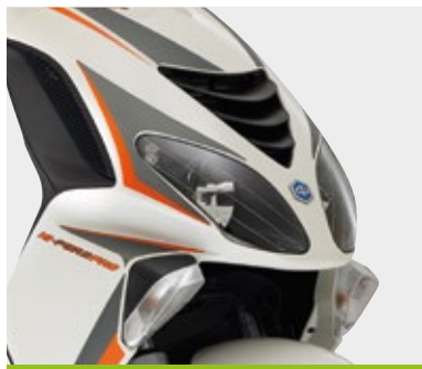
NEW SPORTS GRAPHICS