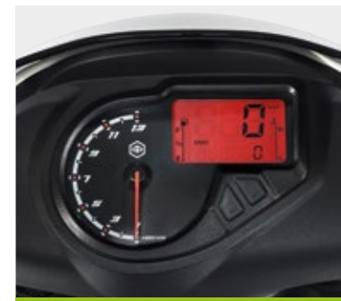
NEW DASHBOARD WITH ANALOGUE AND DIGITAL DISPLAY