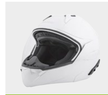
SPACIOUS UNDERSEAT COMPARTMENT, LARGE ENOUGH TO HOLD A FULL-FACE HELMET