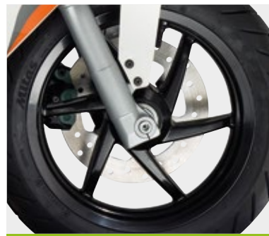
LARGER FRONT DISC