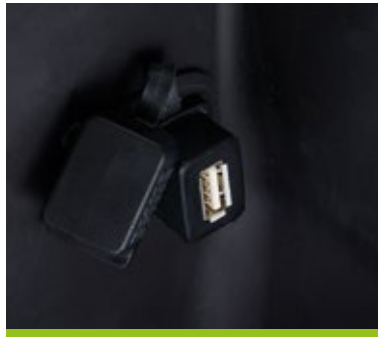
USB PORT IN THE STORAGE COMPARTMENT