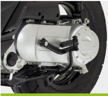
NEW 50cc 2 STROKE ENGINE, AIR-COOLED WITH ELECTRIC IGNITION AND KICK STARTER, EURO 4