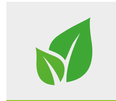
MAXIMUM RESPECT FOR THE ENVIRONMENT WITH LOW FUEL CONSUMPTION