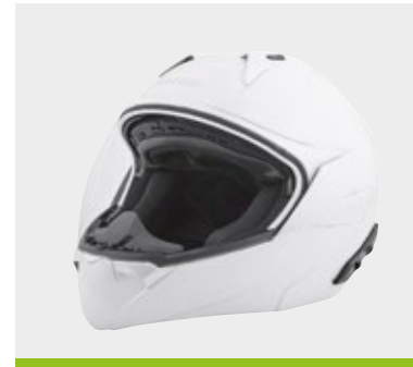
SPACIOUS UNDERSEAT COMPARTMENT, LARGE ENOUGH TO HOLD A FULL-FACE HELMET