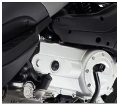
NEW 50 CC I-GET ENGINE 4-STROKE, 3 VALVE ELECTRONIC INJECTION EURO 4