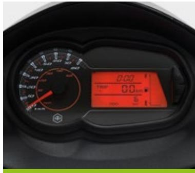
NEW DASHBOARD WITH ANALOGUE AND DIGITAL DISPLAY