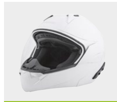
SPACIOUS UNDERSEAT COMPARTMENT, LARGE ENOUGH TO HOLD A FULL-FACE HELMET