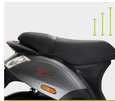
COMFORTABLE SADDLE, ADJUSTABLE TO THREE DIFFERENT HEIGHTS