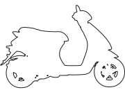
PASTEL WHITE OTTICO