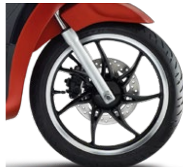
BLACK DIAMOND WHEEL RIMS

The "S" version expresses all the energy of your personality and dynamism of your daily life. Details that set the style tone: the saddle with exclusive finishes, the diamond-edged wheel rims and the black rear view mirrors. 3 engines are available: 50, 125 ABS and 150 ABS, with a Matte Titanium Grey or Matte Red livery so that you can stand out with a touch of style.