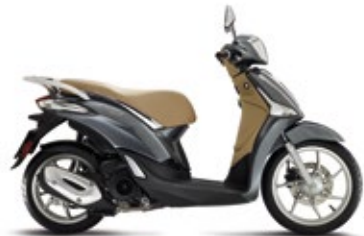
GRIGIO TITANIO LUCIDO

Liberty S 50 i-get | 125 i-get ABS | 150 i-get ABS