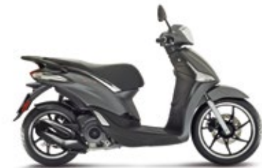
GRIGIO TITANIO OPACO