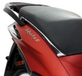
BLACK REAR GRAB HANDLE