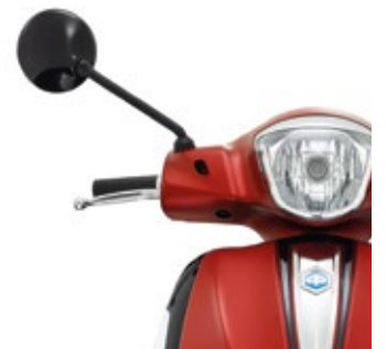
BLACK REAR VIEW MIRRORS